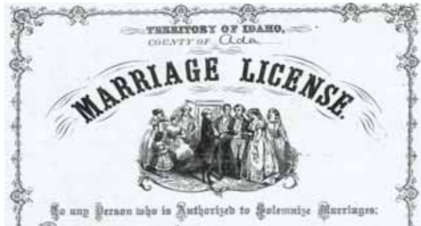
1884 marriage license from Ada County, Idaho (AR 202) records

state registrar of vital statistics. The county recorder at each Idaho county courthouse may have a copy of marriage records filed in that county, although in some cases the records themselves have been transferred to the L&A. Many county-level marriage registers have been microfilmed and are available at the L&A and at Family History Centers.