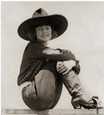
"From Cheyenne to Pendleton, the Rise and Fall of the Rodeo Cowgirl"