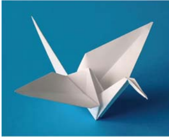
Origami will be featured at Japan Night on March 4.